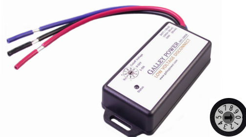
Flushed Selector (Waterproof)

The GPC LVD module is a micro-controller-based solid-state low voltage disconnect load switch. It prevents battery from over-discharge by disconnecting the attached load if the battery voltage drops below a pre-defined threshold. It reconnects the load when the battery is recharged above the threshold.